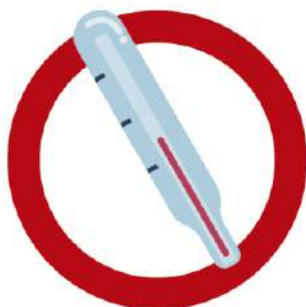
FEBRE / FIEBRE